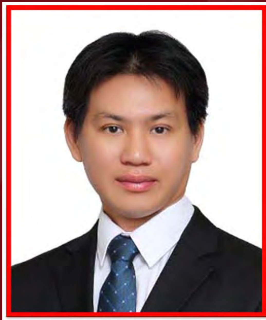
DIRECTOR OF DEVELOPMENT (WOMEN)