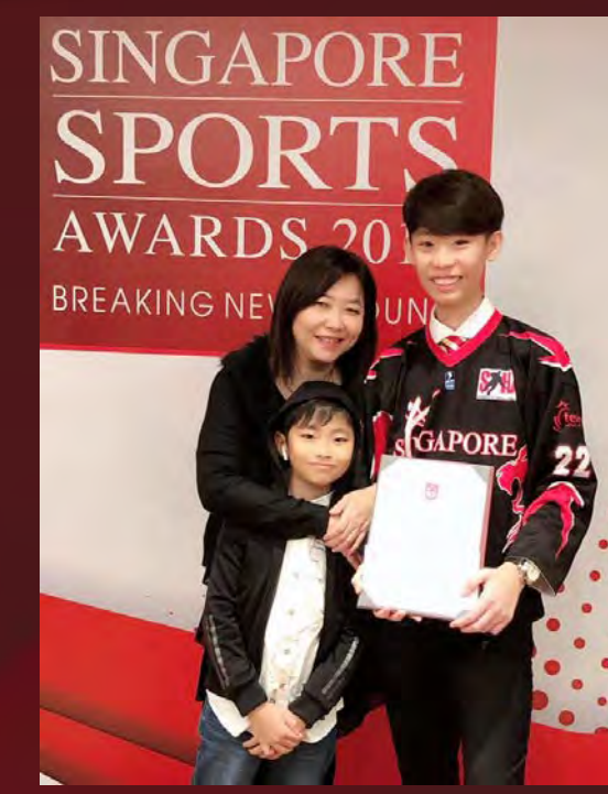
Therese & Kane Marketing